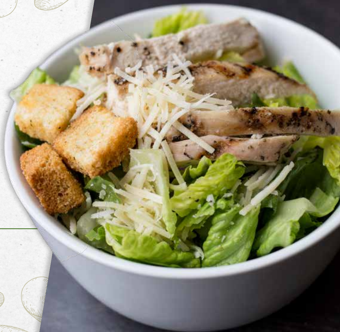
Grilled Chicken Caesar Salad