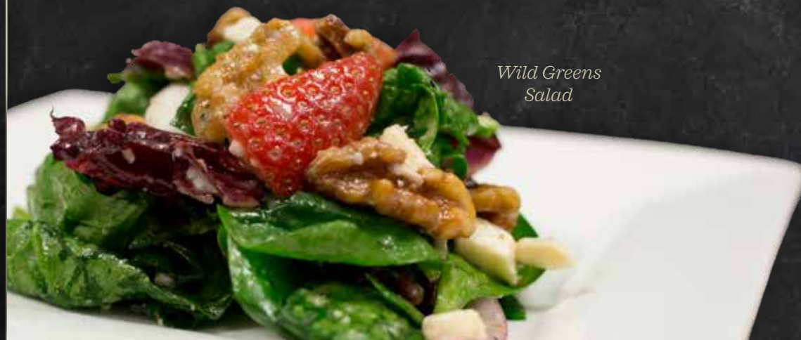
Wild Greens Salad

Each of our plated dinner selections are served with fresh baked bread, choice of salad, gourmet dessert, iced tea, water, and coffee. China is required for all plated meals.