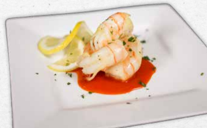
Jumbo Shrimp Cocktail