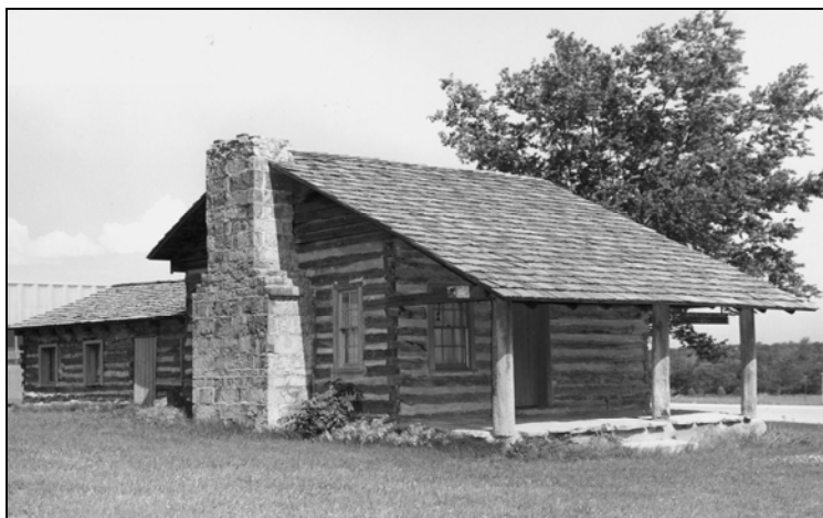
Sager Cabin in 1960