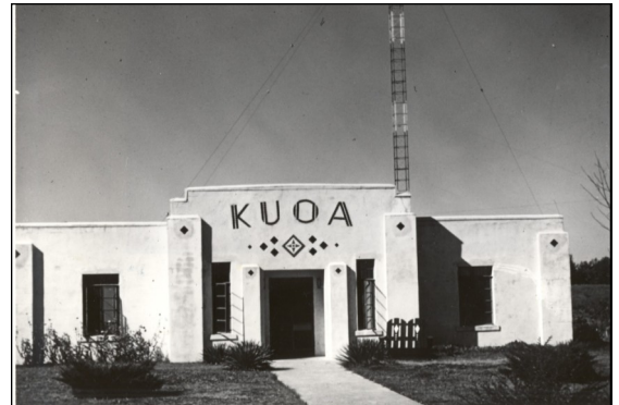
KUOA radio tower