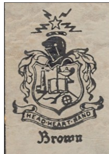
Original Coat of Arms, 1938